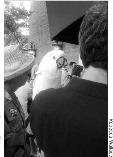
A cockatoo stays calm in the World Music Day crowd.