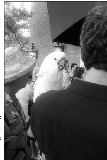
A cockatoo stays calm in the World Music Day crowd.